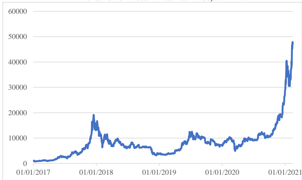
Figure 1 Behavior of Bitcoin Market Price, 2017-2021